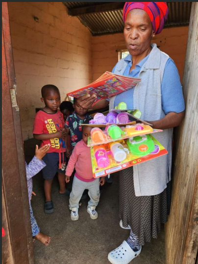
Siyazama Creche received the same, toys and educational material which were greatly appreciated.