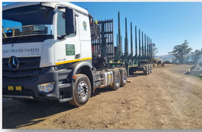
New equipment bought, to better service our customers.