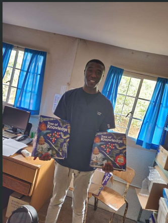
Books were handed over to Harding Special School, a school catering to the needs of kids with disabilities.