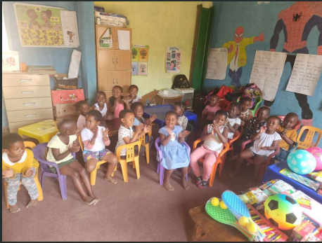
Winterton Creche in Harding, received toys and educational material. The kids were so excited, it was like Christmas had come early this year.